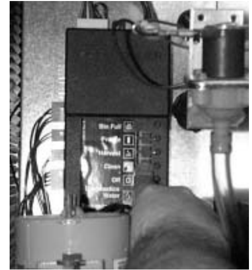
Step 14: Push and Release the Clean Button

22. Return the front panel to its normal position and secure it to the machine with the original screws.