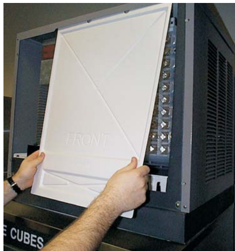
Step 5: Remove Evaporator Cover

6. Push and release the Clean button. The Clean indicator light will be blinking, and the pump will restart.