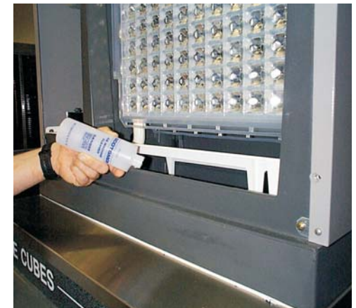
Step 7: Pour Ice Machine Cleaner Into the Reservoir

7. Pour 12 ounces of Scotsman Ice Machine Cleaner into the reservoir water. Return the evaporator cover to its normal position.